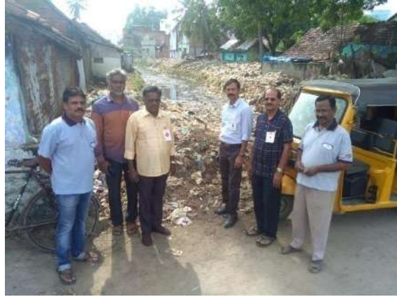
Plastic waste in the Parakingkal cannal