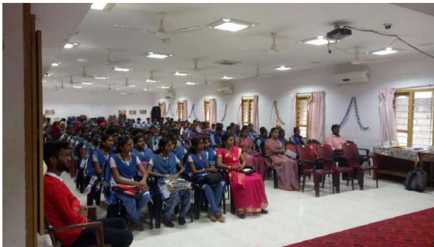
Volunteers and Programme Officers