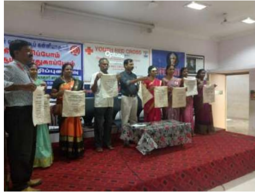
Distributes the non plastic bags with his team