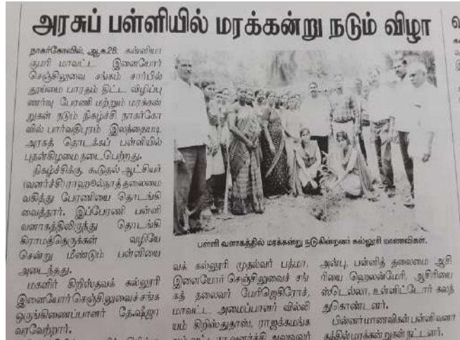
Dina Thanthi Daily