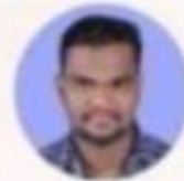
A. Bebin NET - 2019