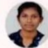
P. Bavani GATE - 2023