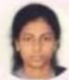
A. Daphini NET - 2024