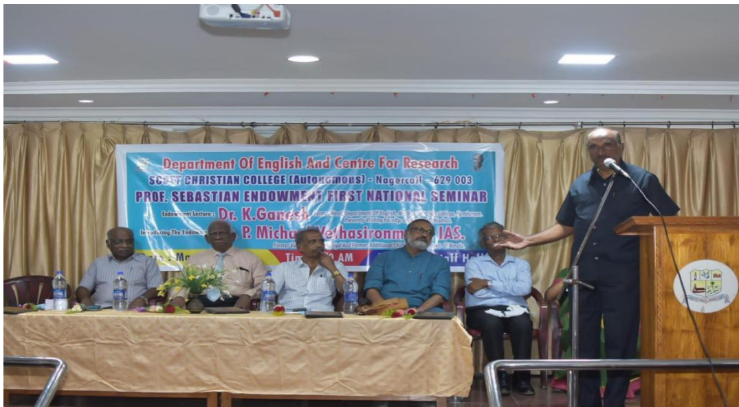
Prof. Sebastian Endowment First National Seminar on 25.03.2022, Department of English