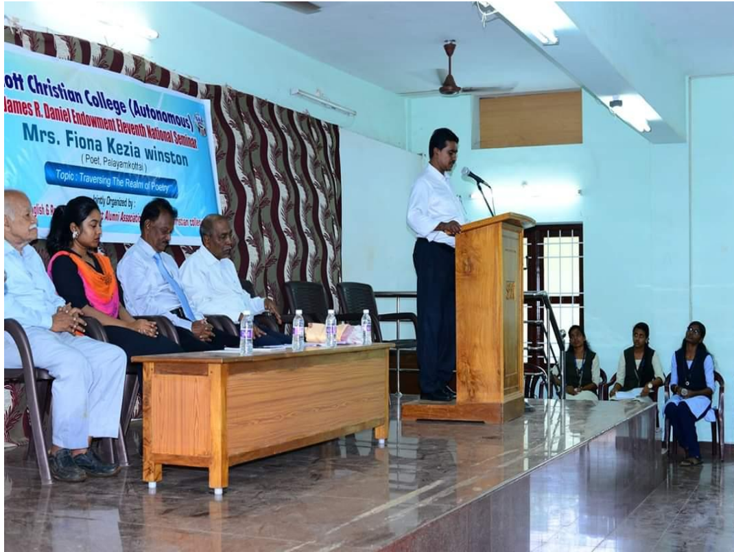
Dr. E. James R. Daniel Endowment Eleventh National Seminar on "Traversing the Realm of Poetry" on 24.09.2019, Department of English