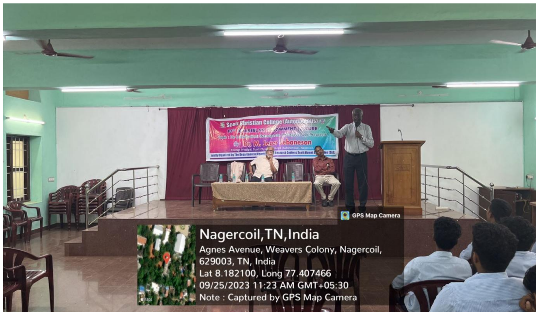
Tenth Jayaseelan Endowment Lecture on 25 th September 2023, Department of Commerce