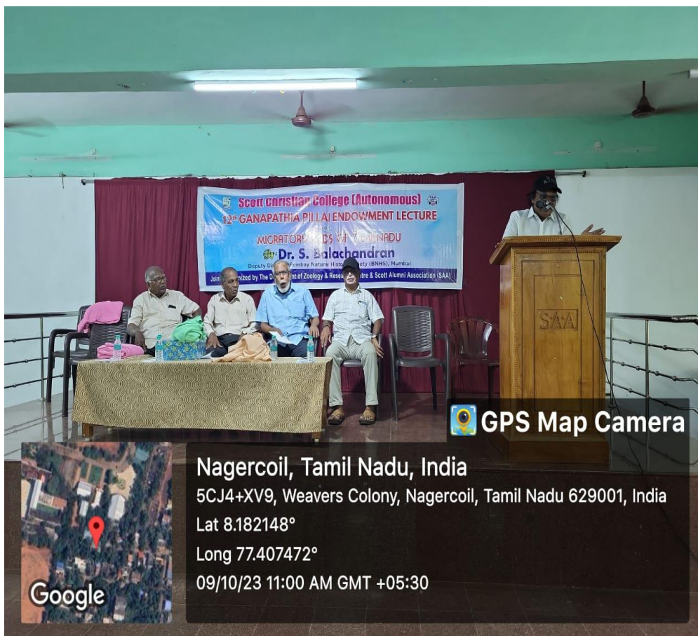
12 th Ganapathia Pillai Endowment Lecture, Department of Zoology